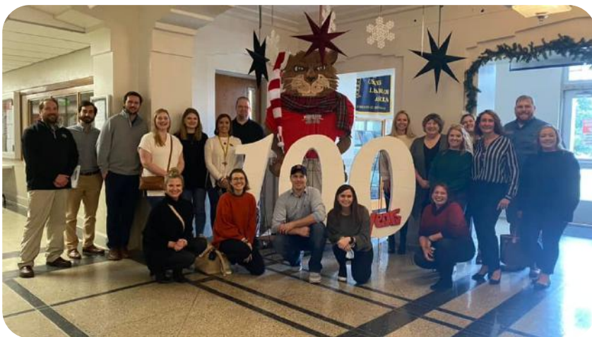
Ruston High School

Leadership Lincoln is sponsored by Origin Bank and Hunt, Guillot & Associates along with other tiered membership levels. See rustonlincoln.org/leadership-lincoln for all sponsors and info on this program.