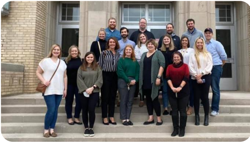
Ruston High School

The January session will focus on Healthcare & Social Services.