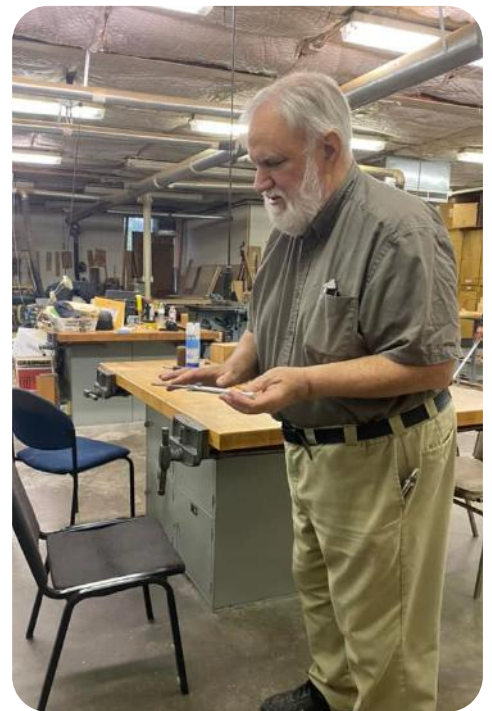
LA Center for the Blind