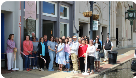
THE COLLECTIVE (318) 202-3510 103 NORTH TRENTON ST., RUSTON INSTAGRAM