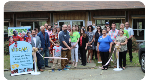
KIDCAM SUMMER CAMP (877) 4KIDCAM @ LINCOLN PARISH PARK KIDCAMP.COM