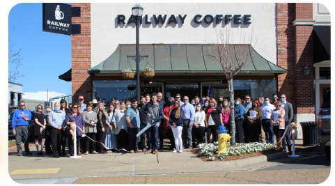
RAILWAY COFFEE (318) 436-2759 130 WEST PARK AVE., RUSTON RAILWAYCOFFEE.COM