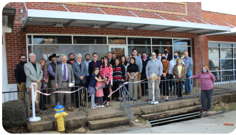
YEAGER, WATSON & ASSOCIATES, LLC (318) 202-5708 118 SOUTH TRENTON ST., RUSTON

More photos on Facebook @RustonChamber .