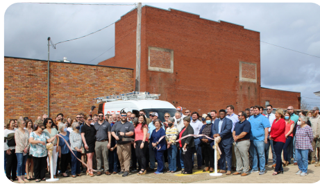
DELTA BROADBAND, LLC (318) 232-0570 115 EAST MISSISSIPPI AVE., RUSTON DELTA-BROADBAND.COM