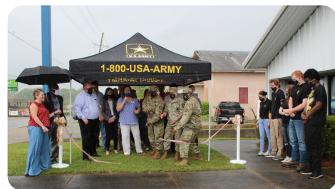
RUSTON ARMY RECRUITING STATION (318) 255-6863 300 WEST CALIFORNIA AVE., RUSTON FACEBOOK