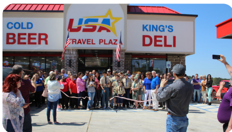
USA TRAVEL PLAZA #13 (318) 202-3603 1701 HIGHWAY 33, RUSTON FACEBOOK