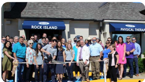
ROCK ISLAND PHYSICAL THERAPY (318) 513-3008 927 NORTH TRENTON ST., STE. B, RUSTON ROCKISLANDPT.COM

More photos on Facebook @RustonChamber .