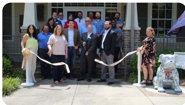
UNITI FIBER (318) 540-9933 363 VENABLE LN., MONROE UNITI.COM