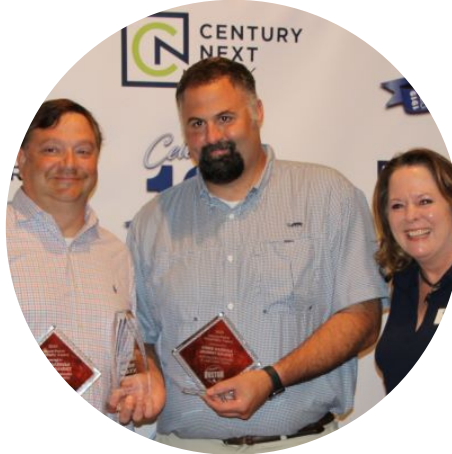
BOTY Award Log Cabin Grill