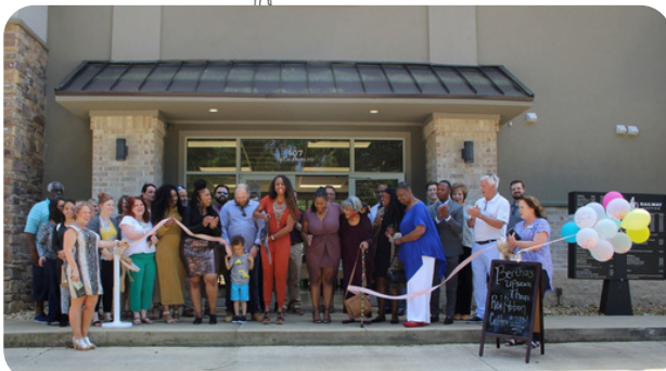
BERTHA'S UPSCALE THRIFT (318) 436-2145 107 PELICAN BLVD., RUSTON FACEBOOK