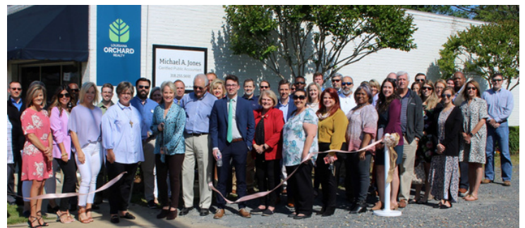
LOUISIANA ORCHARD REALTY (318) 243-7803 302 WEST MISSISSIPPI AVE., RUSTON LAORCHARDREALTY.COM