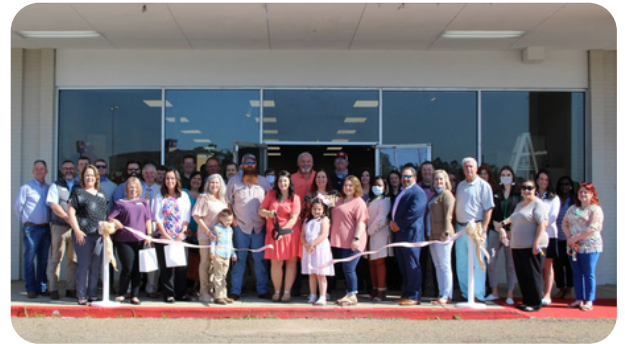
PAISLEY PEACH GIFTS & BOUTIQUE (318) 413-7518 113 NORTH SERVICE RD. EAST, RUSTON FACEBOOK