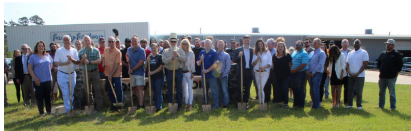
FROSTY FACTORY OF AMERICA, INC. (318) 255-1162 2301 SOUTH FARMERVILLE ST., RUSTON FROSTYFACTORY.COM