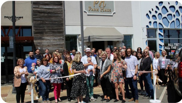
PARK HAUS (318) 366-3309 112 WEST PARK AVE., RUSTON PARKHAUSRUSTON.COM